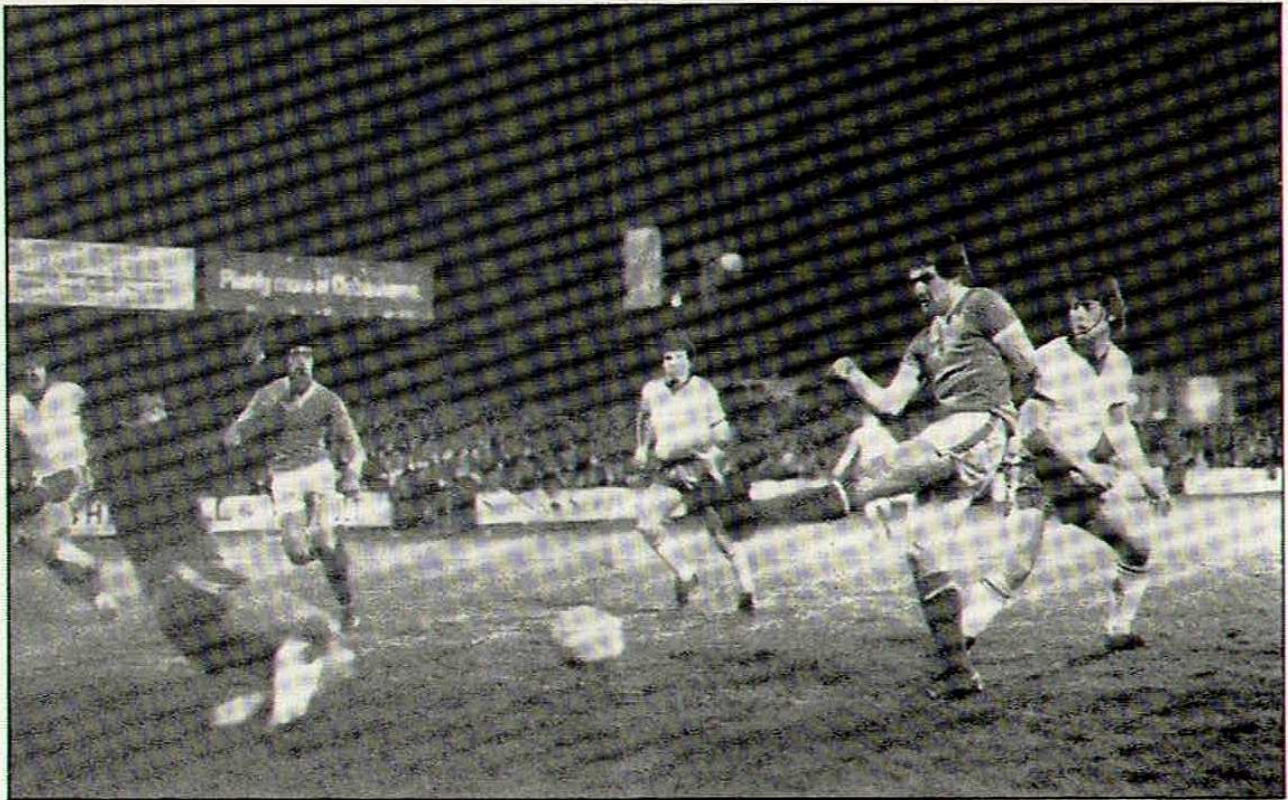
One that didn't go in - Striker Andy Rowland shoots for goal but Torquay goalkeeper Turner saves the shot.